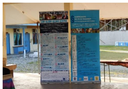
Rights Articles of CRPD 1 - 30

6. Following this session was the review of the Disability Action Plan for Pukapuka which was formulated and developed by the Pukapuka Community during the initial CRPD awareness held on Rarotonga in 2015, during the 50th Celebrations of the Cook Islands self-government. This part of the session was conducted by Ms. Lanieta Matanatabu, who took the participants through the six Key Result Areas of the Action Plan, aligned with the Key Result areas of the Disability Inclusive Development Project. Refer Annex 2 of report.