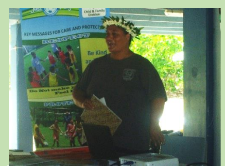
role & responsibilities of the Gender Unit

14. Ms Marsters also touched on Articles 10 and 11 of the Convention on elimination of all forms of discrimination against women (CEDAW) on Education and Employment. These two articles have important effect on both men and women including those with some form of disability in relation to accessing and opportunity to quality education Ms Tupopongi Marsters presenting on the and decent employment.